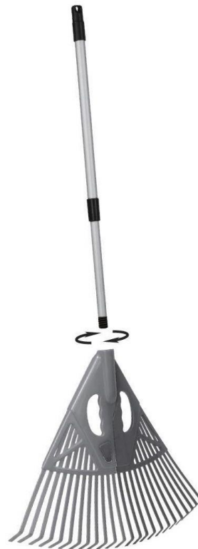
Twist handle clock-wise to attach to head.