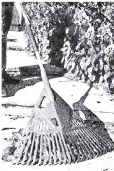
Use rake to rake up leaves.