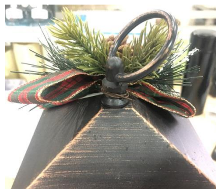
Attaching the pine cone/bow decoration

Batteries required: (not included) 2x C 1.5V batteries