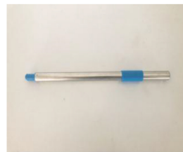
Middle part of the pole