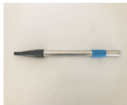
Bottom part of the pole