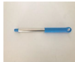
Top part of the pole