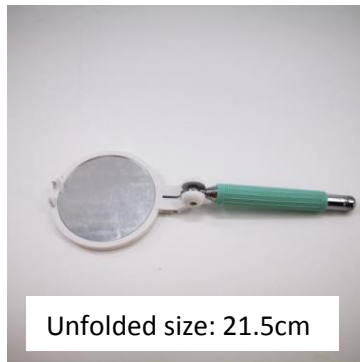
Unfolded size: 21.5cm