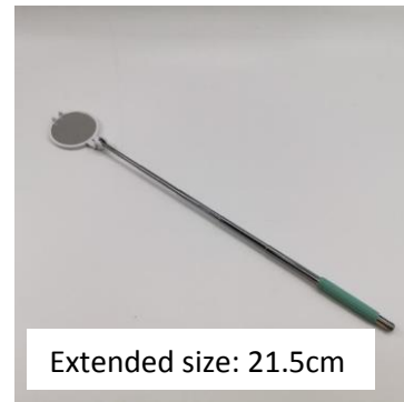
Extended size: 21.5cm