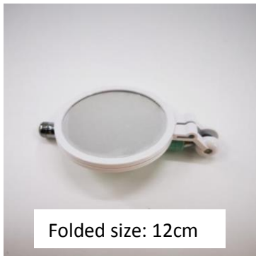
Folded size: 12cm