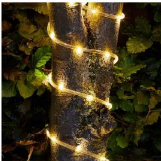
G766 GR – 5m Green Spiral Light Chain G766 RE – 5m Red Spiral Light Chain G766 WH – 5m White Spiral Light Chain