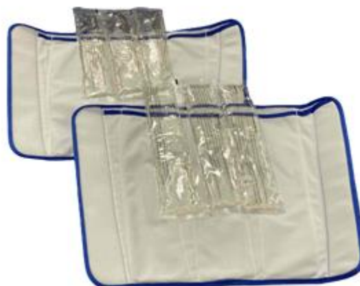
Gel packs are 25.4cm (L) x6.35cm (W)