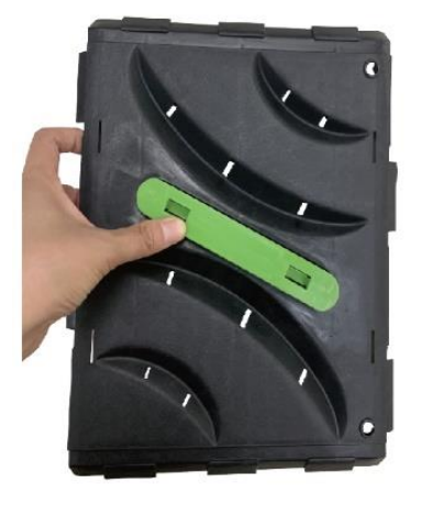
Attach whisks to the side panels.