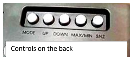
Controls on the back

The minute digits are blinking and can be set by pressing UP or DOWN for setting the minutes.