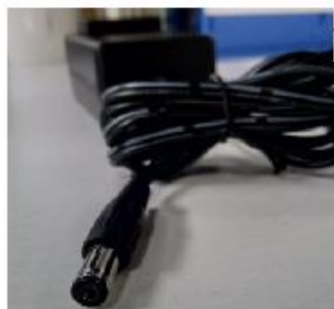
DC power jack