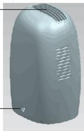
DC power jack