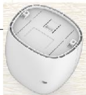
Dry air outlet