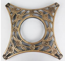
Chair centre brace x2