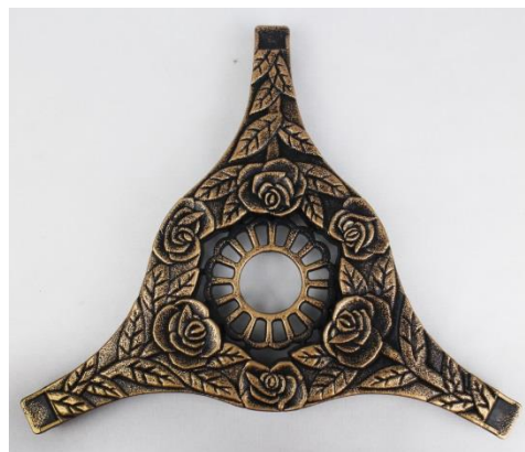
Table centre brace x1