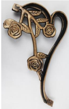
Arm rest x4