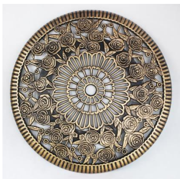
Table top x1