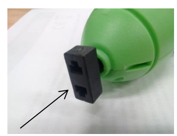
Remove top (pull hard).

To fit the shield, pull off the trim top and fit the shield ensuring the two grooves in the shield align as shown below.