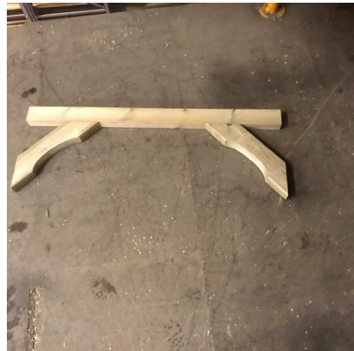
Part 6 : Rear support bar