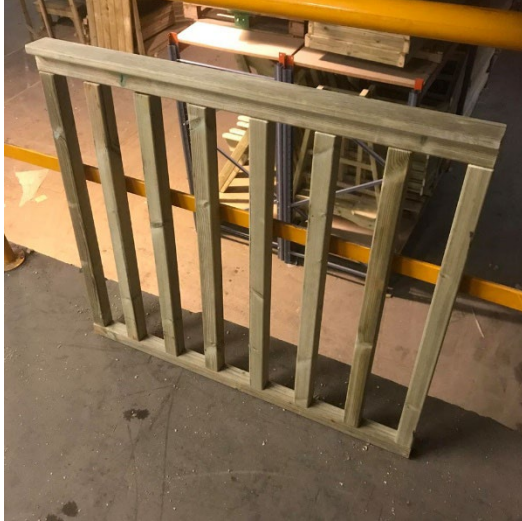
Part 1 Back Panel