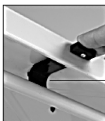
To fold down, push down on the black lever to release the safety locking clip before folding