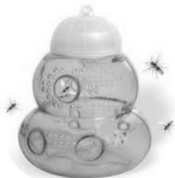
For use in the day