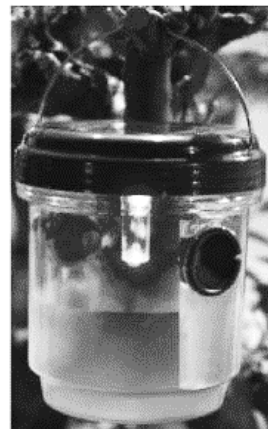
For use in the day and evening (solar)